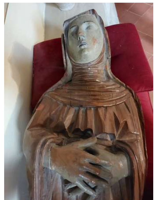
Figure Five: the medieval, wooden reliquary of Angela of Foligno