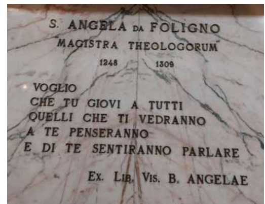
Figure Four: the inscription behind the tomb of Angela of Foligno, Church of St Francis, Foligno