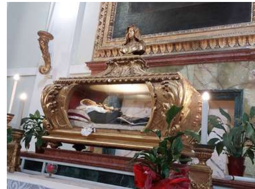
Figure Three: the modern tomb of Angela of Foligno, Church of St Francis, Foligno

While the figure of Francis of Assisi rightly towers in Christian cultural history, it is important to remember that many female figures associated with the Franciscan movement are also very worthy of study and remembrance both in academic and devotional contexts.